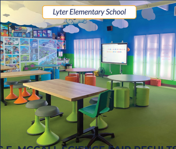
Lyter Elementary School