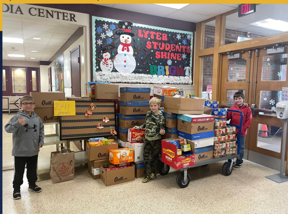
Turkey Trot Food Drive at Lyter Elementary raised 2,141 items to be donated to the Harvest of Hope Food Pantry and Backpack Program.