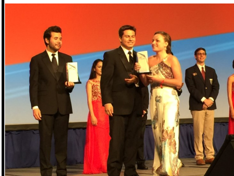
Autumn on stage.

The competition is part of a competitive events program sponsored annually by FBLA-PBL, an association for students pursuing business and business-related careers. Individuals, local chapters, and state teams compete in events representing a range of leading edge business, career, and leadership development activities. The winners of these challenging and prestigious awards are selected from FBLA-PBL's 270,000 members, and have won state and regional competitions to qualify for the national awards program. The delegates elect national student officers and attend business and leadership workshops in addition to competing in business and career skill events. FBLA-PBL provides innovative leadership development programs to bring business and education together in a positive working relationship. Participation in FBLA-PBL can have a direct impact on the direction and success of a young person's career. Millions of students have learned through active membership in FBLA-PBL about the world of business and what is expected of them in the workplace.